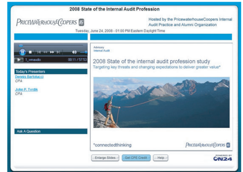
AUDIO Streaming + Slides

PGi is partnered with ON24. ON24 currently delivers over 35,000 events per year. ON24 has a proven track record of flawless execution of "live" events and is the only